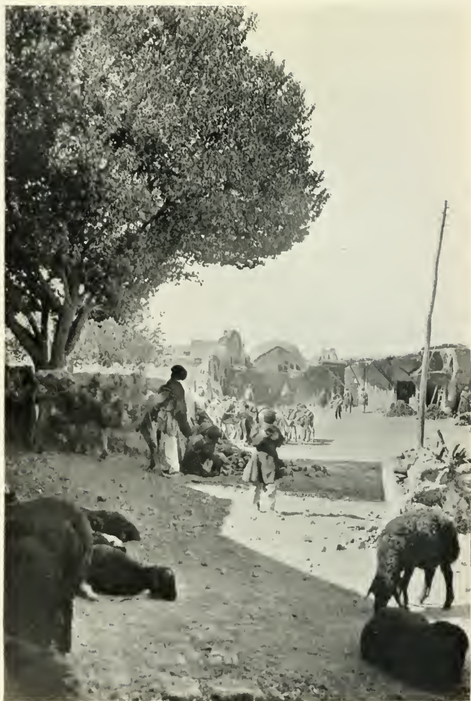
A STREET IN TABRIZ